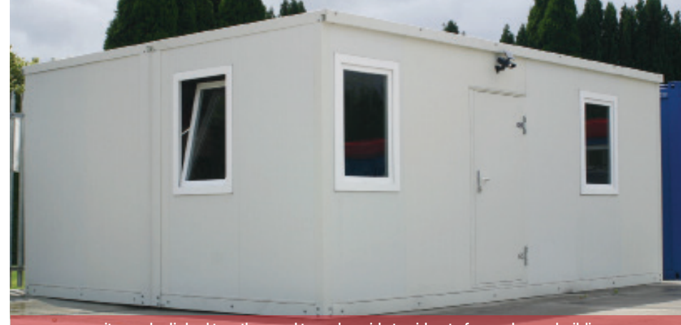
units can be linked together, end to end or side to side - to form a larger building

Durable protective powder coated finish: