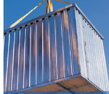
the XPandaStore™ can be lifted and moved by crane or forklift, with a 1.5 tonne load onboard!