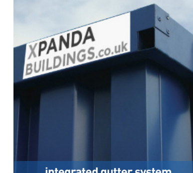
integrated gutter system