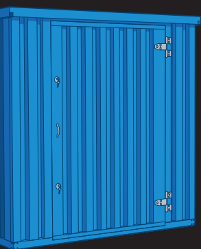
2m or 3m or 4m 2.1m 2.1m