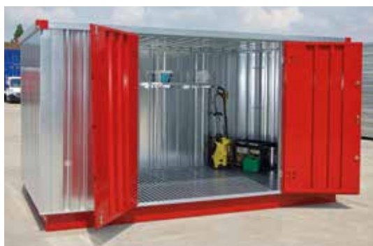
Expandachem - Flat-packed storage unit for the safe storage of chemicals and lubricants