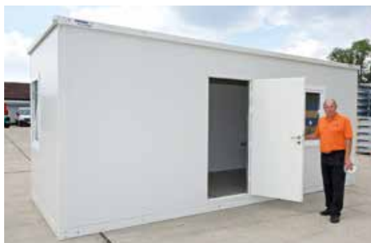
Expandacom - Flat-packed office/ accommodation unit