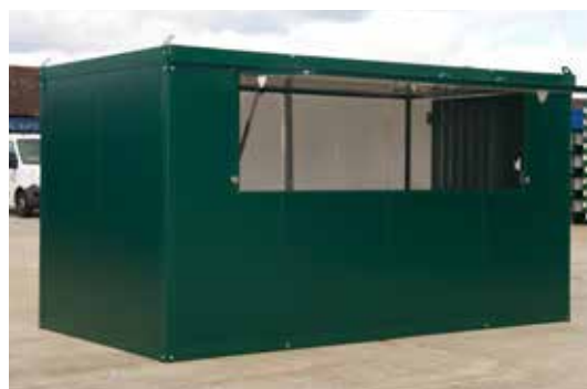
Expandakiosk - Flat-packed storage unit with serving hatch