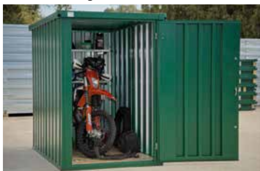
Bikestore - Flat-packed secure storage unit for cycles, motorcycles and tools