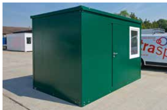
Expandakabin - Flat-packed office unit home and commercial use