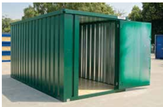
Expandastore - Flat-packed storage unit