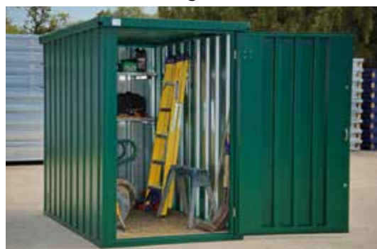
Gardenstore - Flat-packed secure storage unit for all your garden equipment

The Expandarange of flat-packed buildings is available from: