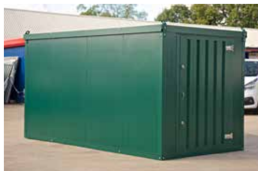
Insulated Store - Flat-packed storage unit