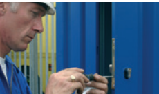
simple to assemble