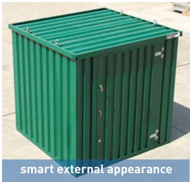
smart external appearance