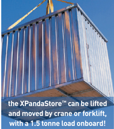
the XPandaStore™ can be lifted and moved by crane or forklift, with a 1.5 tonne load onboard!