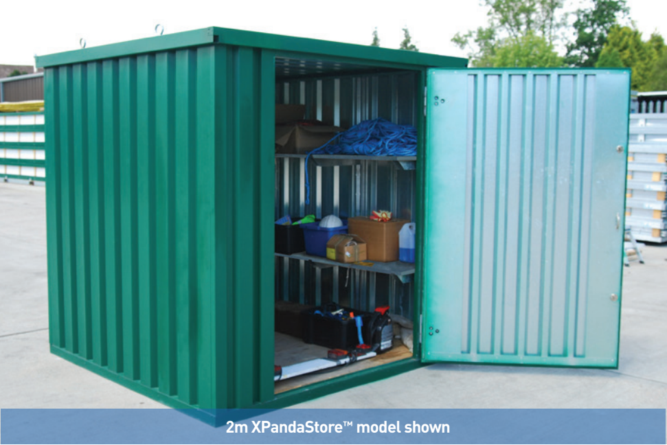
2m XPandaStore™ model shown

(other special colours available on request)