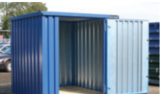
ready for use