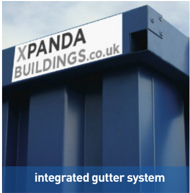
integrated gutter system